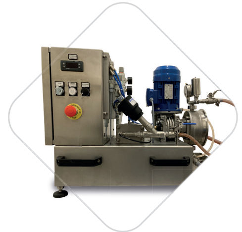
SMALL PLANT (0.1 m 2 )